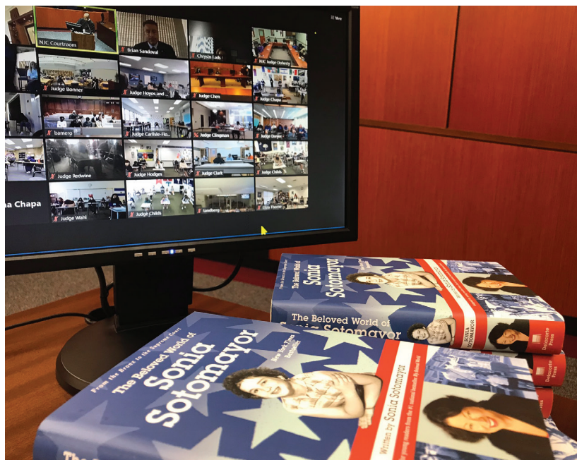
Middle and high school students who participated in the virtual Reading & Robes program were given autographed copies of Justice Sotomayor’s autobiographical “The Beloved World of Sonia Sotomayor.”

Justice Sotomayor’s Reading & Robes appearance came less than a week after the death of her friend Justice Ruth Bader Ginsburg.